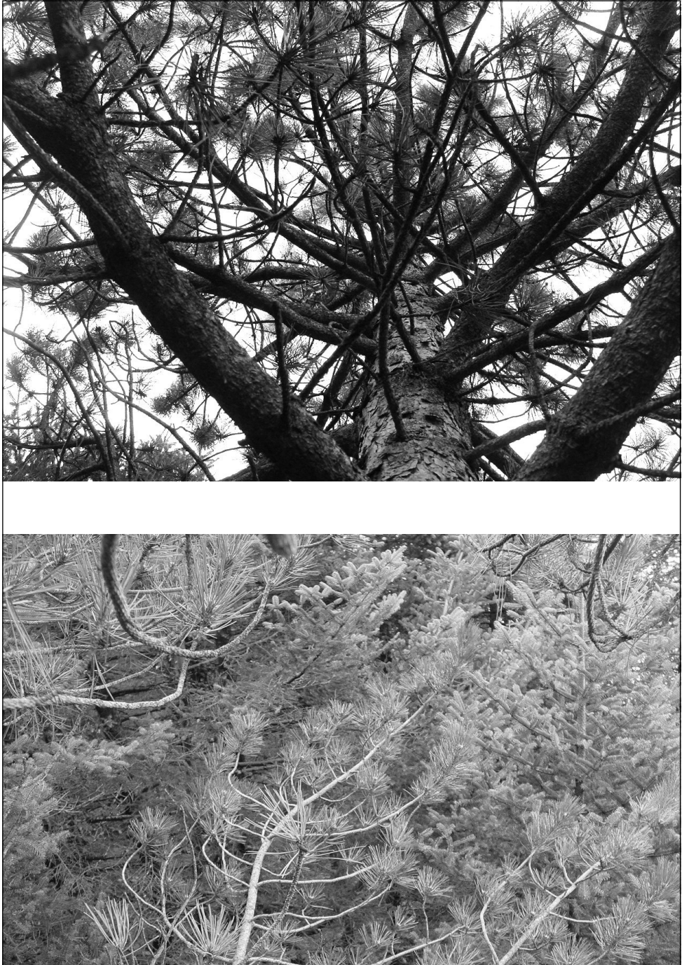
Fig. 1. Upper part of Pinus nigra subsp. nigra trunk (above). Pinus nigra subsp. nigra branches, mixed with Abies cephalonica branches (below).